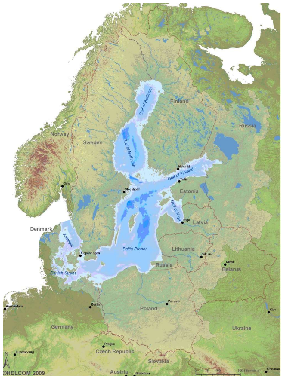
Figure 1: The Baltic Sea Region

Helsinki Commission) is the governing body of the Convention. HELCOM establishes goals and monitors the environmental status of the Baltic Sea, and it issues recommendations to support reaching the targeted ecological status of the Baltic Sea and catchment area.